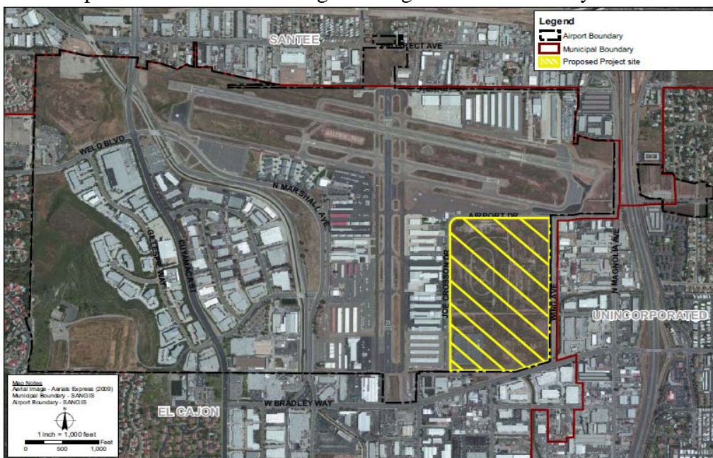
The project area is outlined in yellow